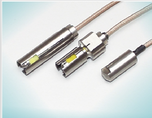
SUPERFLEX-force sensing probes

Adapted sensor plates designed for sensitive In-die force sensing.