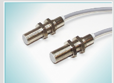
MIAFLEX magnetic-inductive distance sensors (e. g. for ram displacement)