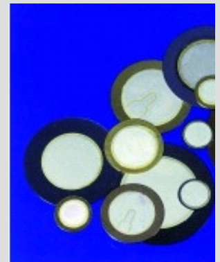
DISCFLEX In-Die Force Sensors